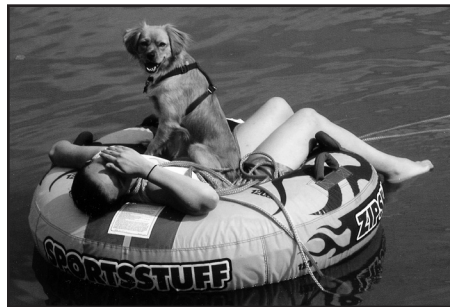
Molly is sitting pretty!